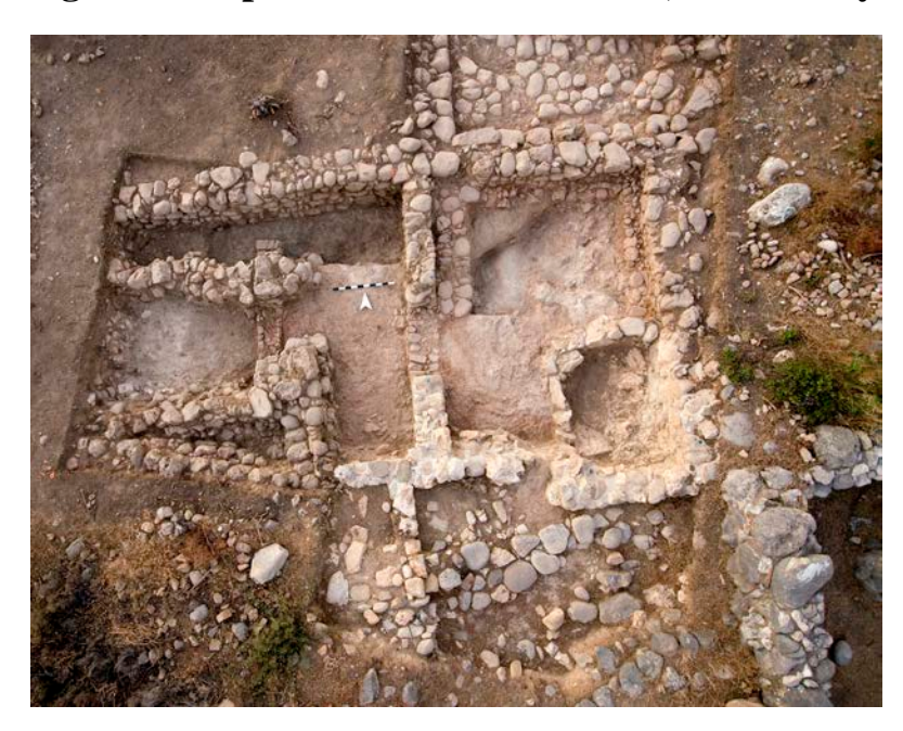
Fig. 3: Aerial View of Trenches 21, 29, 40, 41, 45.

Fig. 2: Protopalatial House and Yard, and "Early Building" to West.