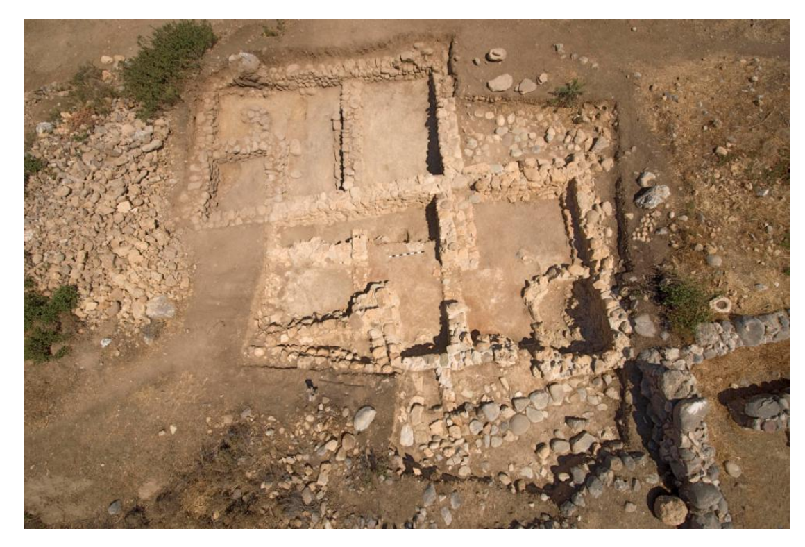
Fig. 5: Aerial View of Trenches 58, 62, 63, 64.