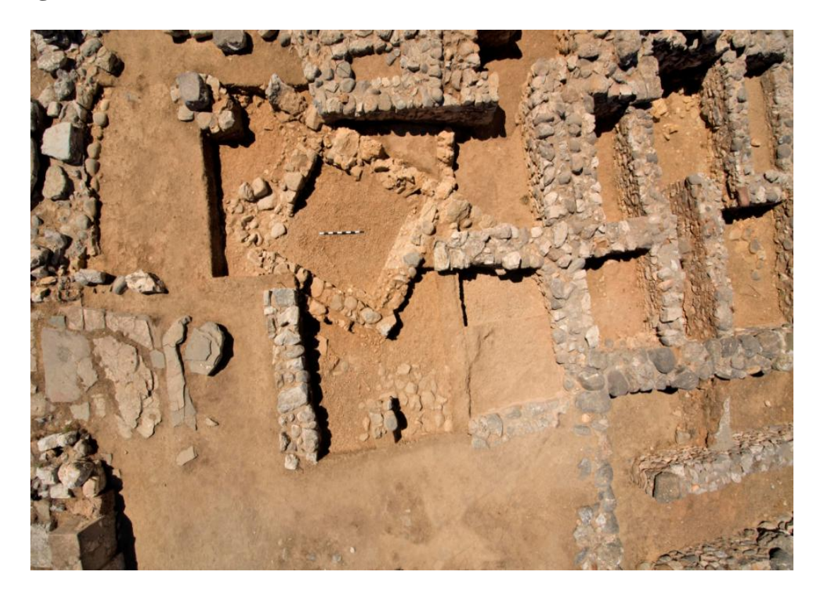
Fig. 7: Trench 56.